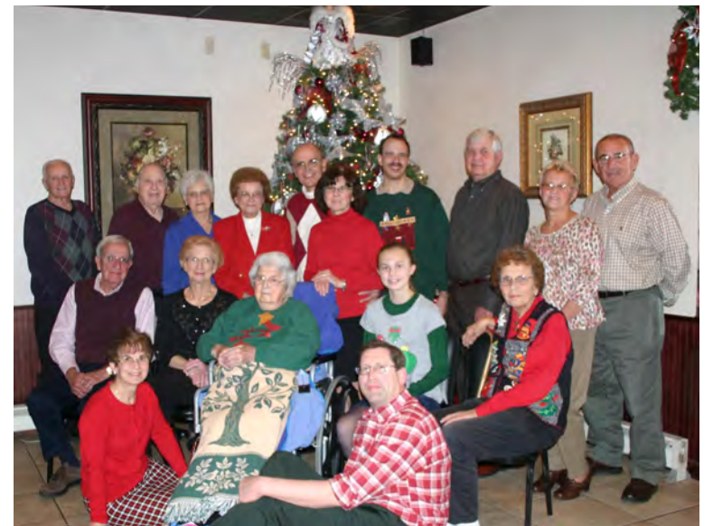
Slovenska Bistrica Lodge 42 during its annual meeting and Christmas party celebration in Girard, Ohio.

You can open an IRA Account with AMLA. Call the Home Office at 531-1900 for the details.