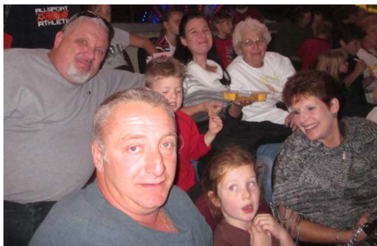
Enjoying a delightful day at the Circus October 22.